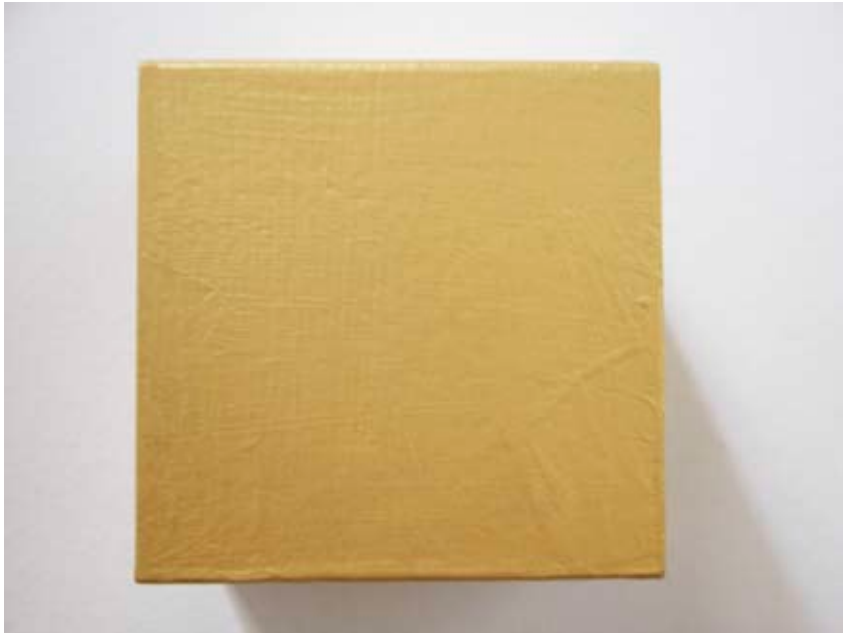
detail The Golden Eternity